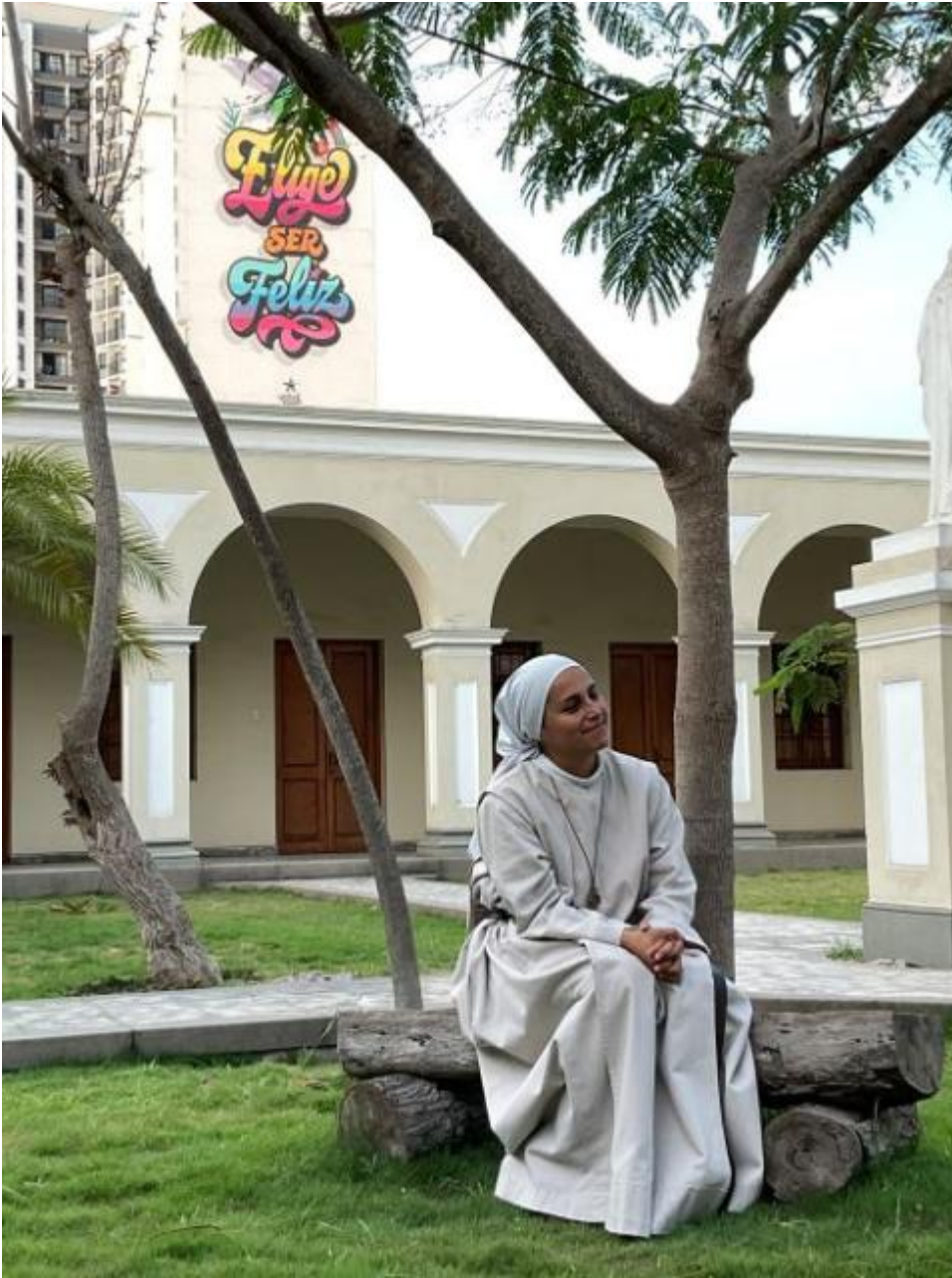
A sister prays in the cloister of the Monastery of the Incarnation in Lima, Peru.

live in pursuit of the comfort of a life with few surprises and, at the same time, with some emotions that embellish it.