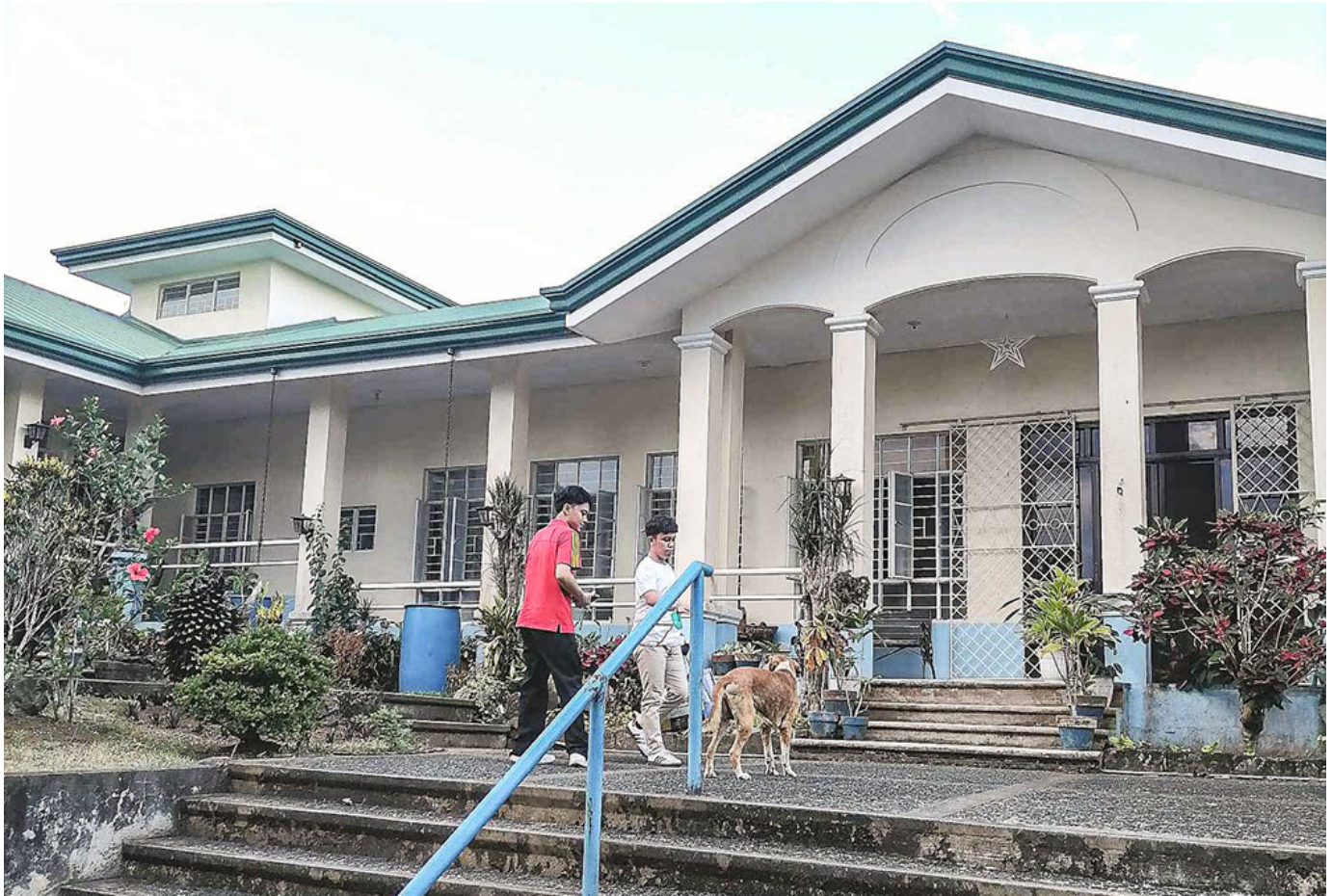
The formation house for the Sisters of the Divine Savior in Silang, Cavite, Philippines (Oliver Samson)

"The constitution should also protect local capitalists, instead of allowing foreigners to have more and more of our country," she said, referring to sand mining operations in the Philippines, in which volumes of sand were hauled by ships off the shore and were suspected of being used by China in creating artificial islands in the contested water between the country and China.