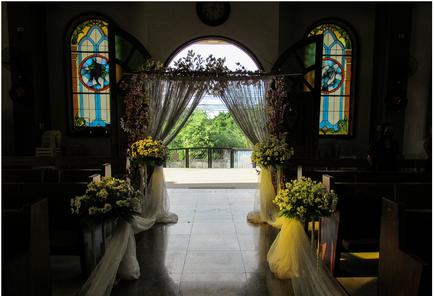
Wedding decorations are seen at the entrance to Santa Lucia Parish Church in San Fernando, Pampanga, Philippines, in 2021.