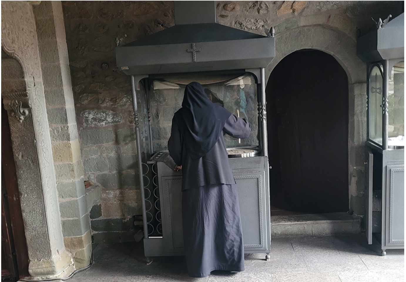
The St. Stephen monastery is now a convent in which 31 Orthodox nuns live.

peace amid the cavities within the cliffs. In the 14th century, monks found the region a shelter from Turkish raids. Over time, they built more than 20 monasteries cradled improbably amid the towering cliffs, stunning examples of architectural ingenuity, human perseverance and spiritual inspiration. The six that remain active house breathtaking Byzantine paintings, mosaics, carvings and ornate candelabras, crosses and sacred objects.