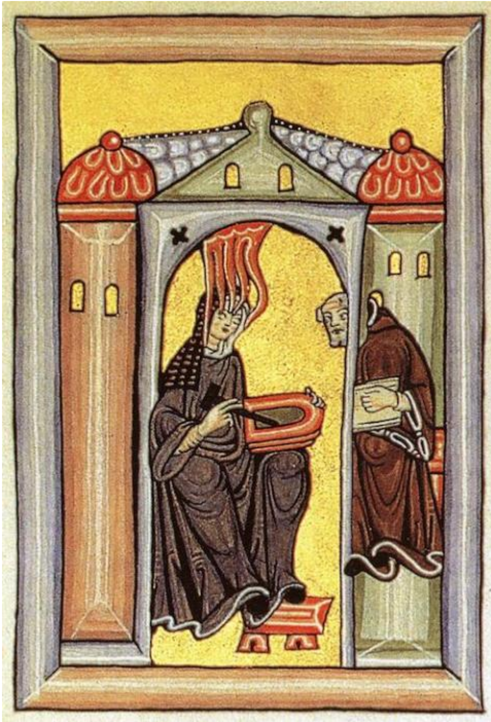
Hildegard von Bingen.

"They're relatively unappreciated," she told GSR. "Certainly, they haven't been displayed as a group before."