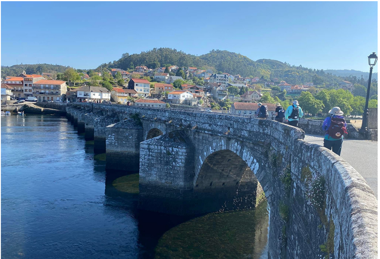
Scenic views along the pilgrimage route to Santiago de Compostela

I hold my pilgrim experience in my heart as a powerful lesson in the beauty of the journey. My pilgrimage began in 2011 as I discerned religious life. In 2021, I walked as a peregrina . Now, in 2025, I embrace the call to be a "Pilgrim of Hope" with my church. My hope for this Jubilee Year is that we, as a faith community, remain open to the wild and exciting journey where the Holy Spirit leads.