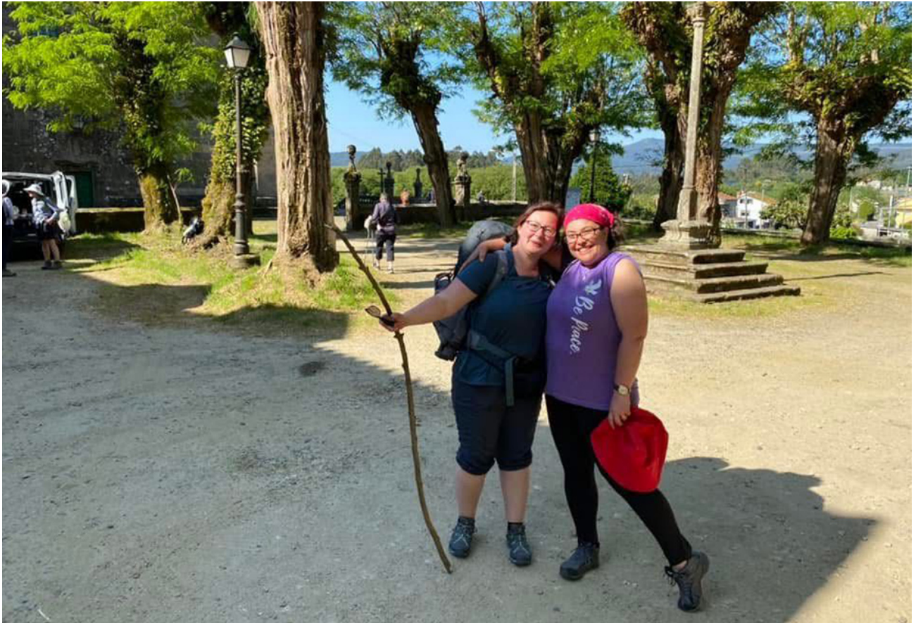
Pilgrims walk together along the road to Santiago de Compostela.

As we walk together in faith, we do so with the awareness that we follow in the footsteps of many generations before us and hold in prayer those who will come after us. Our pilgrimage will lead us through diverse landscapes and bring us into communion with fellow travelers who will share in our joys, struggles and surprises. In this communal journey, I am challenged to walk with my faith community — not rushing, but allowing the Holy Spirit to guide us, ever attentive to God's presence.