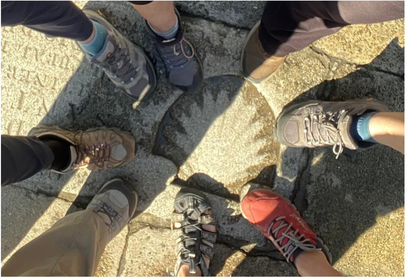
Pilgrims reach the end of their journey at Santiago de Compostela.