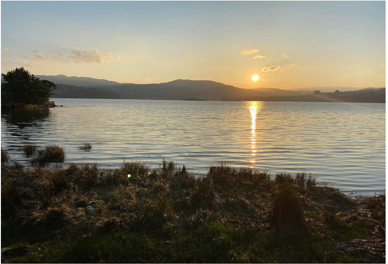
Scenic views along the pilgrimage route to Santiago de Compostela