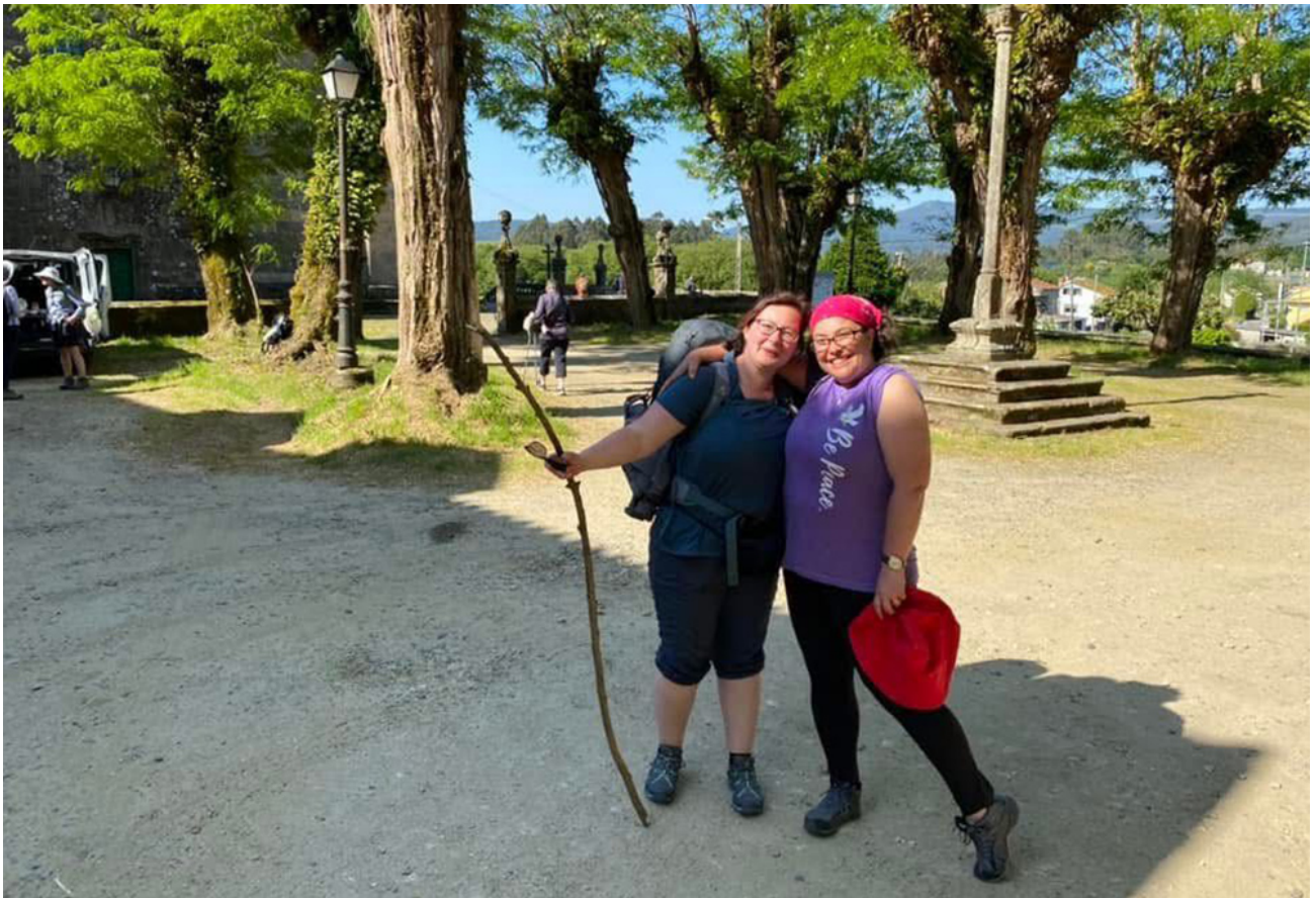
Pilgrims walk together along the road to Santiago de Compostela.

As we walk together in faith, we do so with the awareness that we follow in the footsteps of many generations before us and hold in prayer those who will come after us. Our pilgrimage will lead us through diverse landscapes and bring us into communion with fellow travelers who will share in our joys, struggles and surprises. In this communal journey, I am challenged to walk with my faith community — not rushing, but allowing the Holy Spirit to guide us, ever attentive to God's presence.