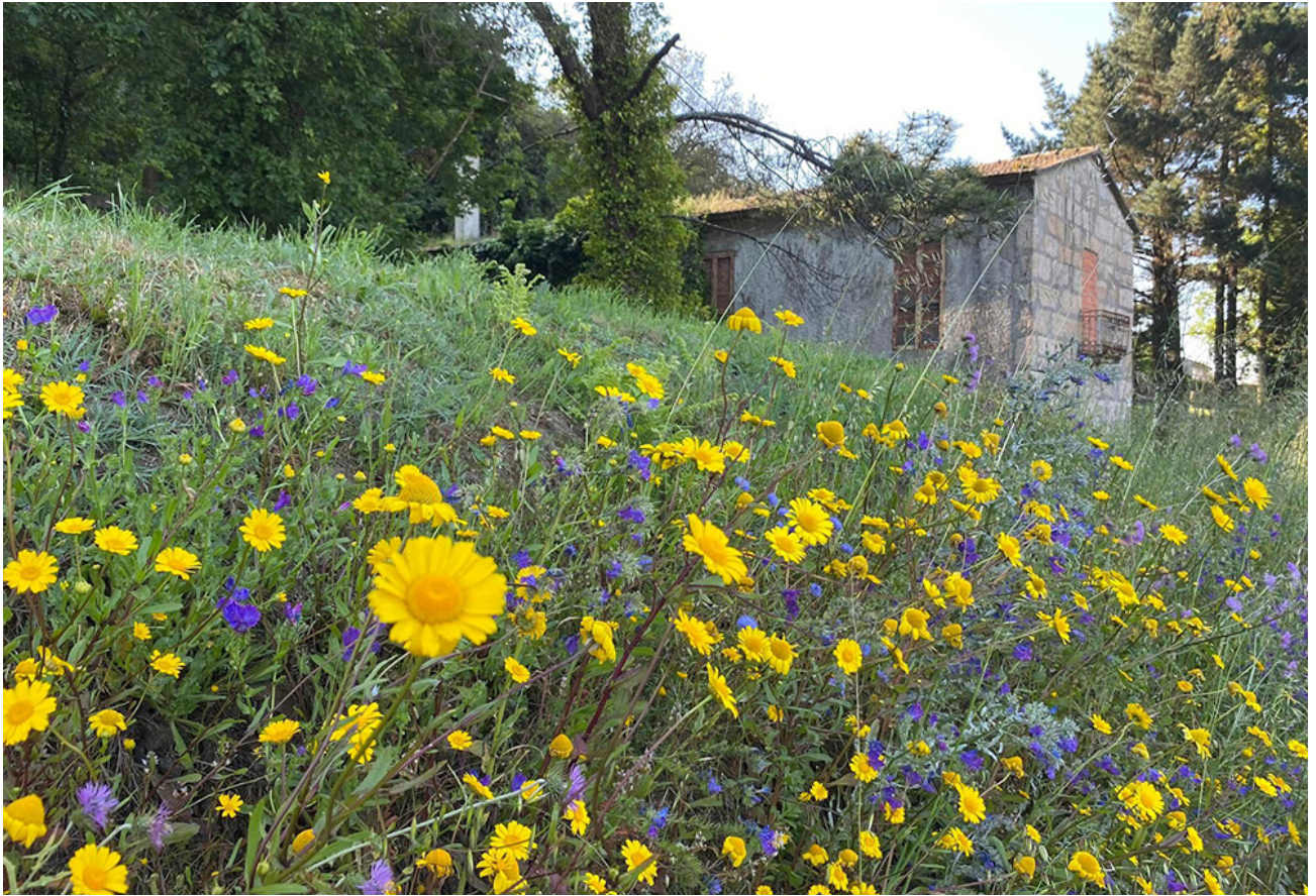
Scenic views along the pilgrimage route to Santiago de Compostela