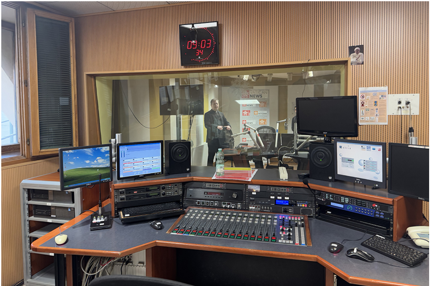
The recording studio at Vatican Radio.

Many presenters shared powerful testimonies of their work with victims of violence, trafficking and poverty in places like Uganda, the Philippines and the U.S.-Mexico border. By communicating these stories with media, sisters said, they're able to put a human face to an issue that otherwise might remain a statistic or distant problem to those who follow the news.