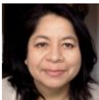
by Rhina Guidos