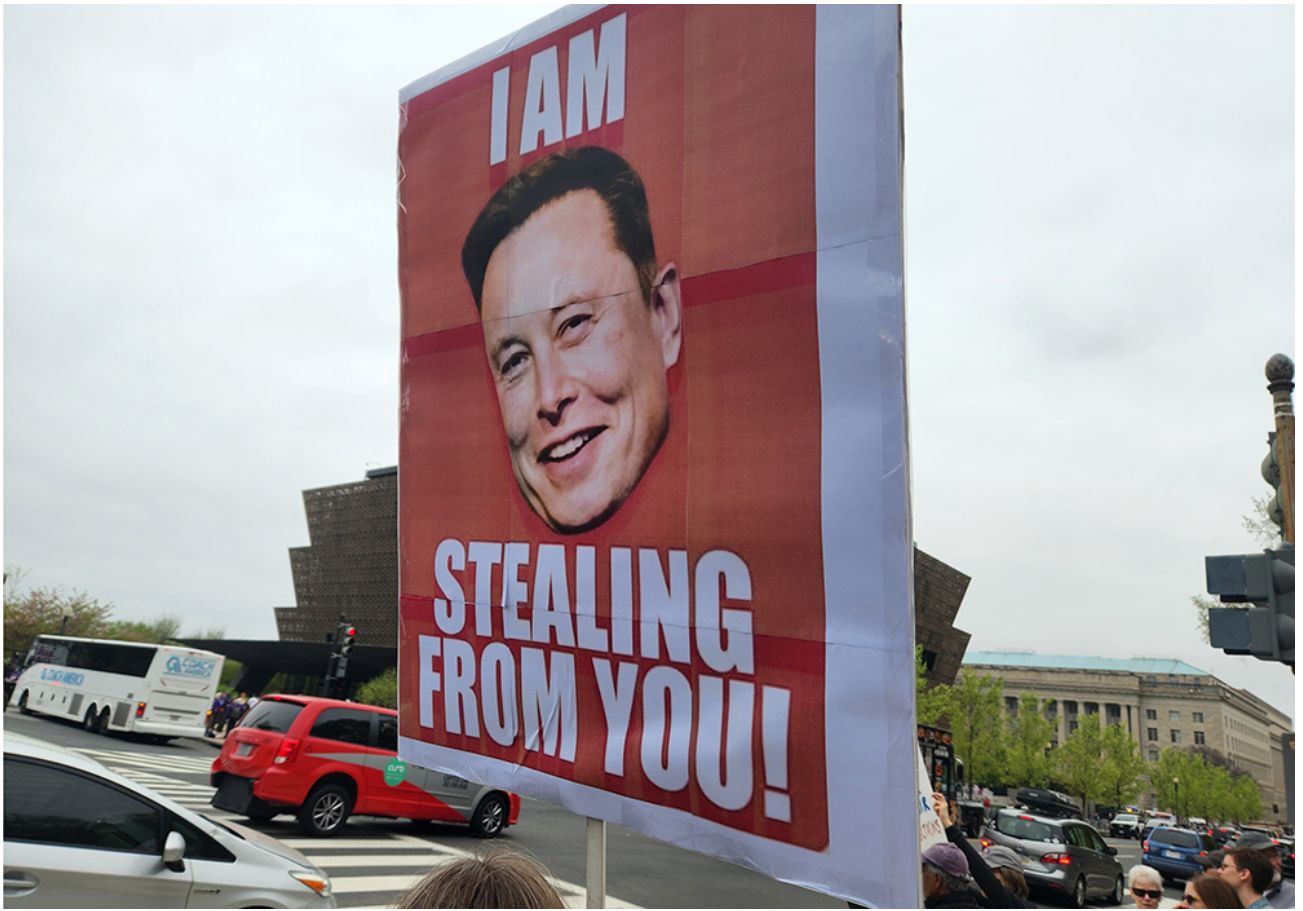
A sign satirizing Elon Musk during the April 5 "Hands Off!" demonstration in Washington, D.C.