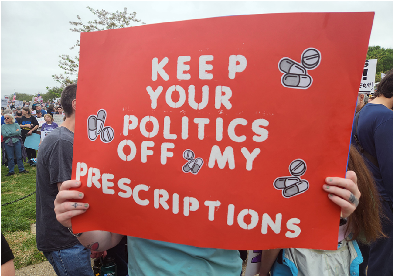
A sign critical of President Donald Trump's policies during the April 5 "Hands Off!" demonstration in Washington, D.C.