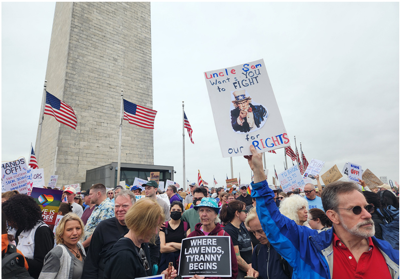
Demonstrators stand at the foot of the Washington Monument on the National Mall during the April 5 "Hands Off!" demonstration in Washington, D.C.

That was a sentiment shared by others in an informal group of more than a dozen faith-based activists — sisters of different congregations, lay associates, supporters — who marched to the Washington rally together.