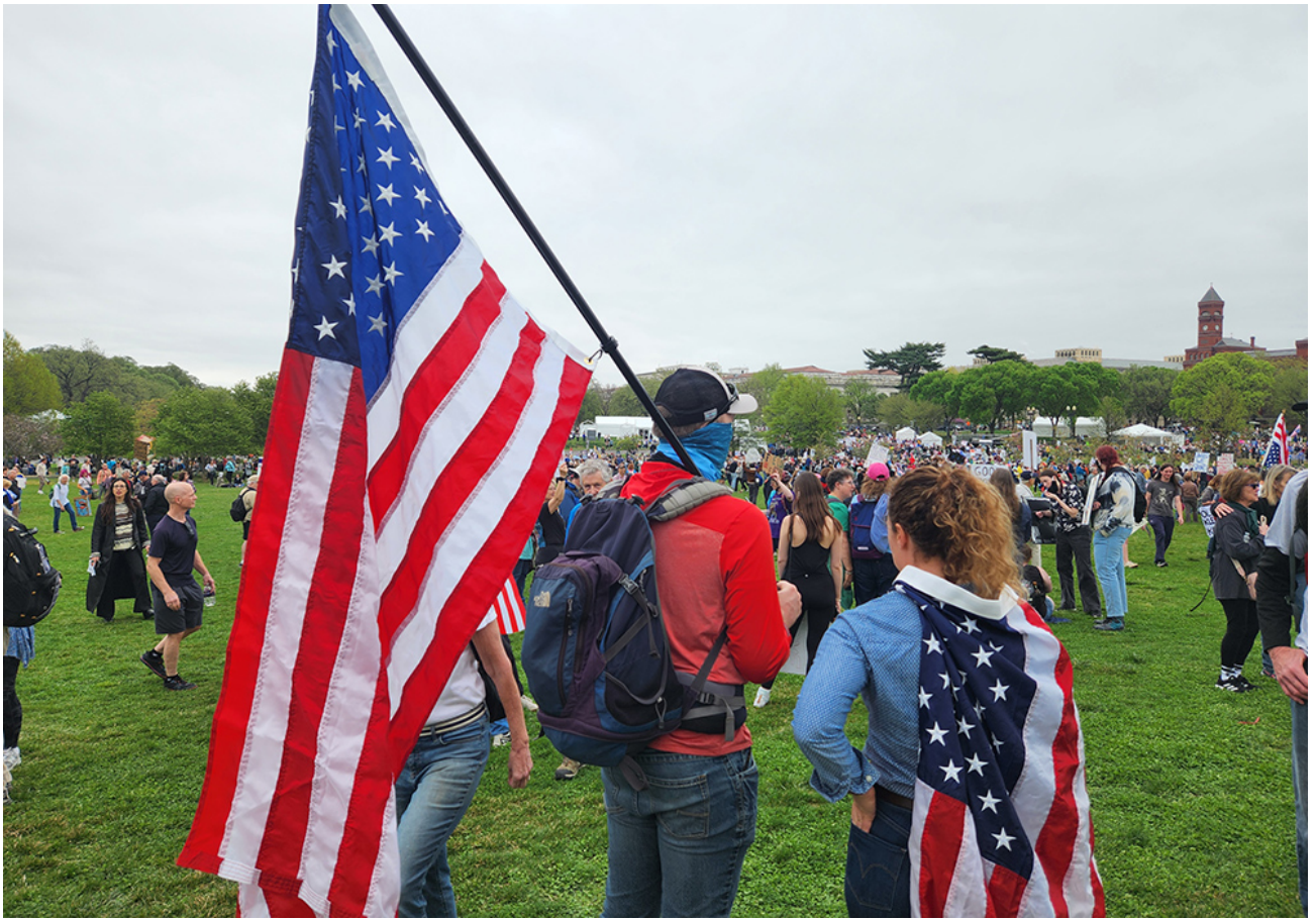
American flags — held aloft or draped around shoulders — were ubiquitous during the "Hands Off!" demonstration April 5 on the National Mall in Washington D.C.