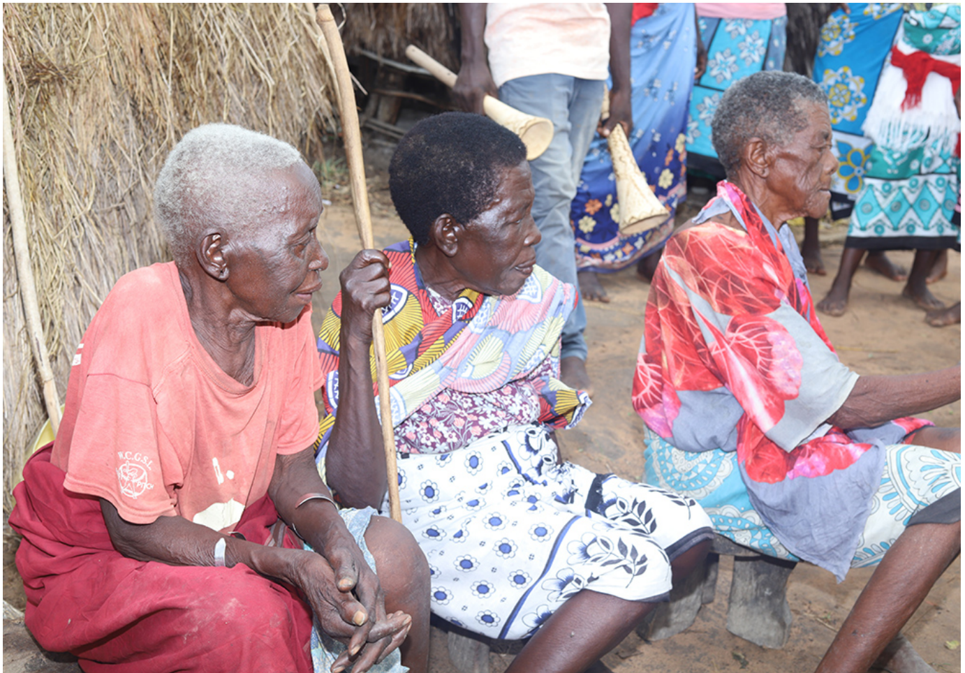
Elderly women evicted from their homes for witchcraft accusations seek refuge at a center in Kilifi, a coastal town in Kenya, on April 24, 2025.

Global Sisters Report visited a majority of the more than 12 shelters in Kilifi region, which mostly exist to house individuals accused of witchcraft, as homes for the elderly are rare in Kenya and in most African countries. In these visits, GSR witnessed firsthand that this phenomenon has displaced thousands of adults.