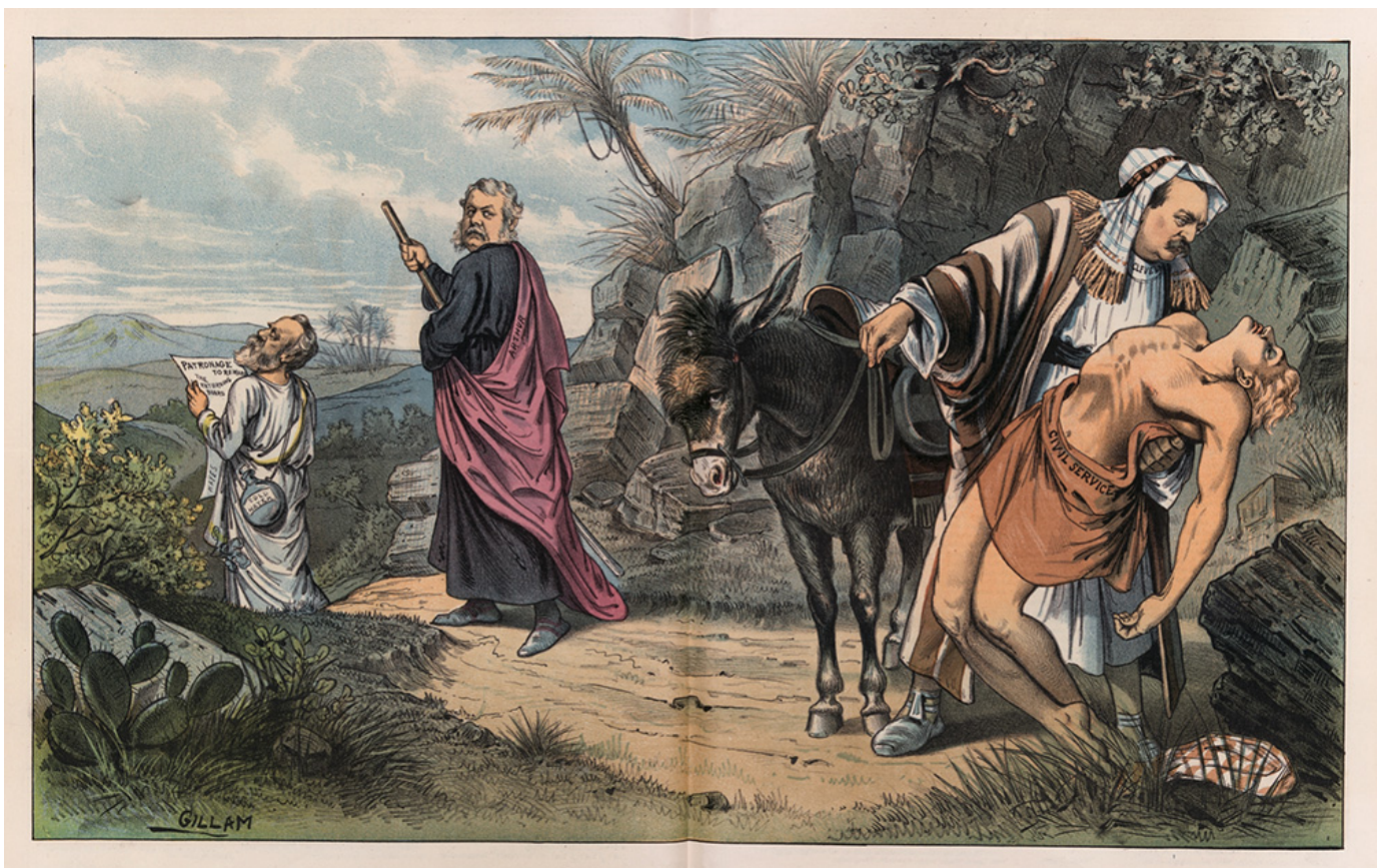
"The good samaritan" (1885) by Bernhard Gillam

A young woman was reading this story and, in her way, she "crossed the street" as she quickly turned the page. She didn't think this was true. The president has said he is only going after waste, fraud and abuse. This kind of story is simply biased against what he wants. And anyway, what kind of life are they living if they have AIDS? Let their country take care of their own. We don't need to help them.