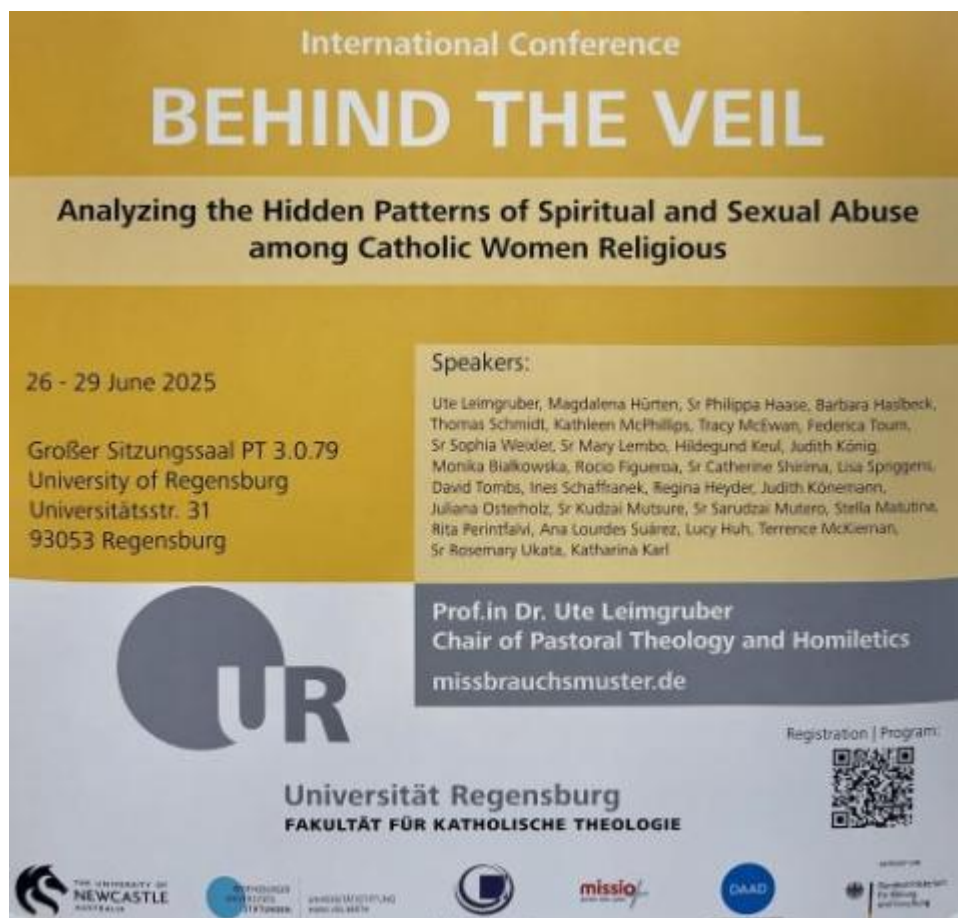
A flyer for the conference "Behind the Veil: Analyzing the Hidden Patterns of Spiritual and Sexual Abuse among Catholic Women Religious"